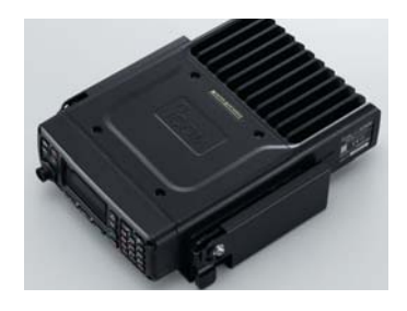
IC-F8101 with optional MB-126.

The IC-F8101 has a durable, enclosed structure securely sealed from intrusion by all potential elements, and is a visibly compact package. The IC-F8101 and the CFU-F8100